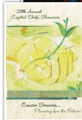
Above: Invitations for this year's Capital Chefs' Showcase display the theme of this year's event: "Cancer Services... Planning for the Future!" At right: Silent Auction items include fine art, jewelry, and plenty of sports memorabilia!